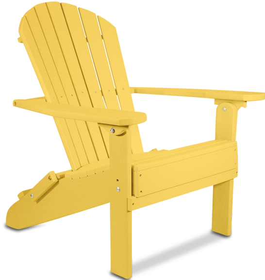
CLASSIC FOLDING ADIRONDACK CHAIR AC03

THANK YOU Thank you for choosing Amish Country Poly. We are confident you'll love this beautiful piece of craftsmanship, and that you'll continue to choose Amish Country for all of your outdoor furniture needs and wants.